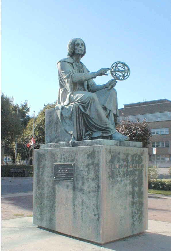
Nicholas Copernicus at the Planetarium of Montreal