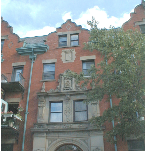
On an apartment building on rue Milton