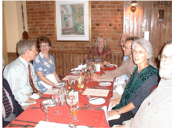
Dining at Aux Deux Charentes