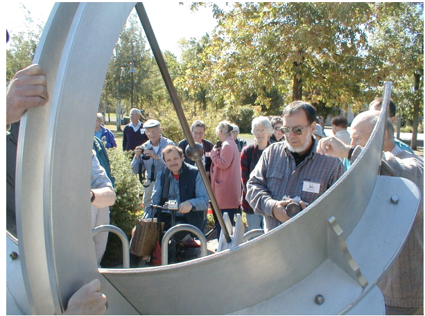
The Parc régional de Longueuil

Our next stops were at the Parc régional de Longueuil and a Marina in Boucherville to see two dials – one modelled after the other.