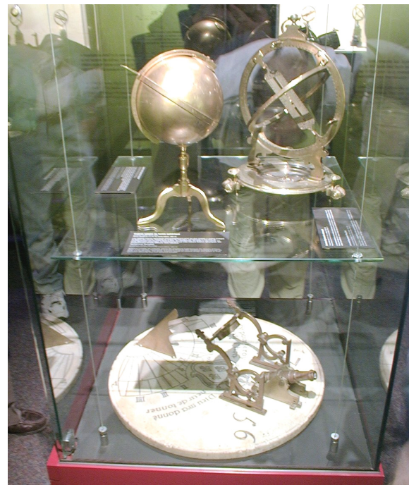
Selections from the Stewart Museum Collection displayed at the Planetarium of Montreal