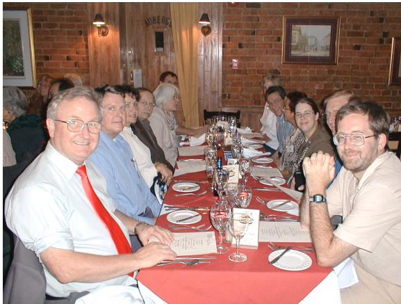
Guests from US, Canada, UK and Switzerland