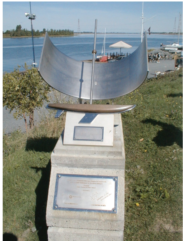
At the Marina de Boucherville

We then found our way out to l'Île-Ste-Hélène, a task that gave us an opportunity to see more of Montreal because of rerouting required by work being done on some of the bridges in the city.