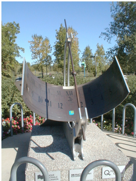
At the Parc régional de Longueuil

Our next stops were at the Parc régional de Longueuil and a Marina in Boucherville to see two dials – one modelled after the other.