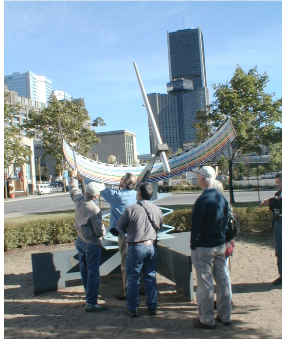
A misaligned dial at the Planetarium of Montreal

60° - far too high for the latitude of Montreal. An explanatory text with the dial acknowledged that the gnomon was placed at the wrong angle, but then proceeded to claim that it didn't make much difference in the reading.