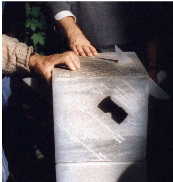
A Blessing!