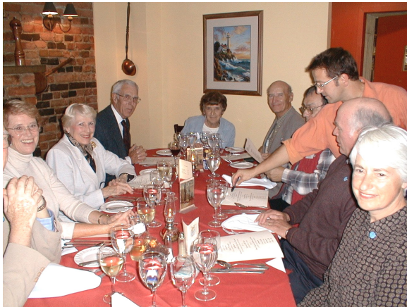
Dining at Aux Deux Charentes